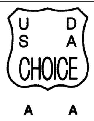
Figure 6 to paragraph (f). Official Quality Grade Identification Mark.

(g) As shown in Figure 7 to paragraph (g) of this section, a shield enclosing the letters "USDA" with the appropriate grade designation "1," "2," "3," "4," or