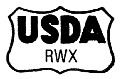
Figure 8 to paragraph (h). USDA Product Control Mark.

regulations to show compliance of products: