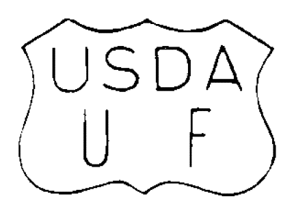
Figure 1 to Paragraph (a). Preliminary Grademark.

(b) A shield enclosing the letters "USDA," as shown in Figure 2 to paragraph (b) of this section, with the appropriate quality grade designation "Prime," "Choice," "Select," "Good," "Standard," "Commercial," "Utility," "Cutter," "Canner," or "Cull," as provided in the United States Standards for Grades of Carcass Beef, the United