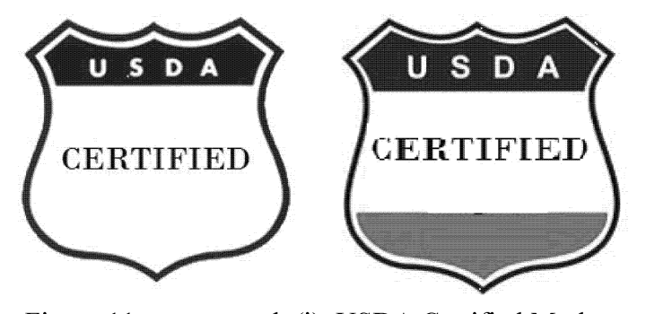
Figure 11 to paragraph (j). USDA Certified Mark.