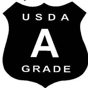
Poultry Figure 5