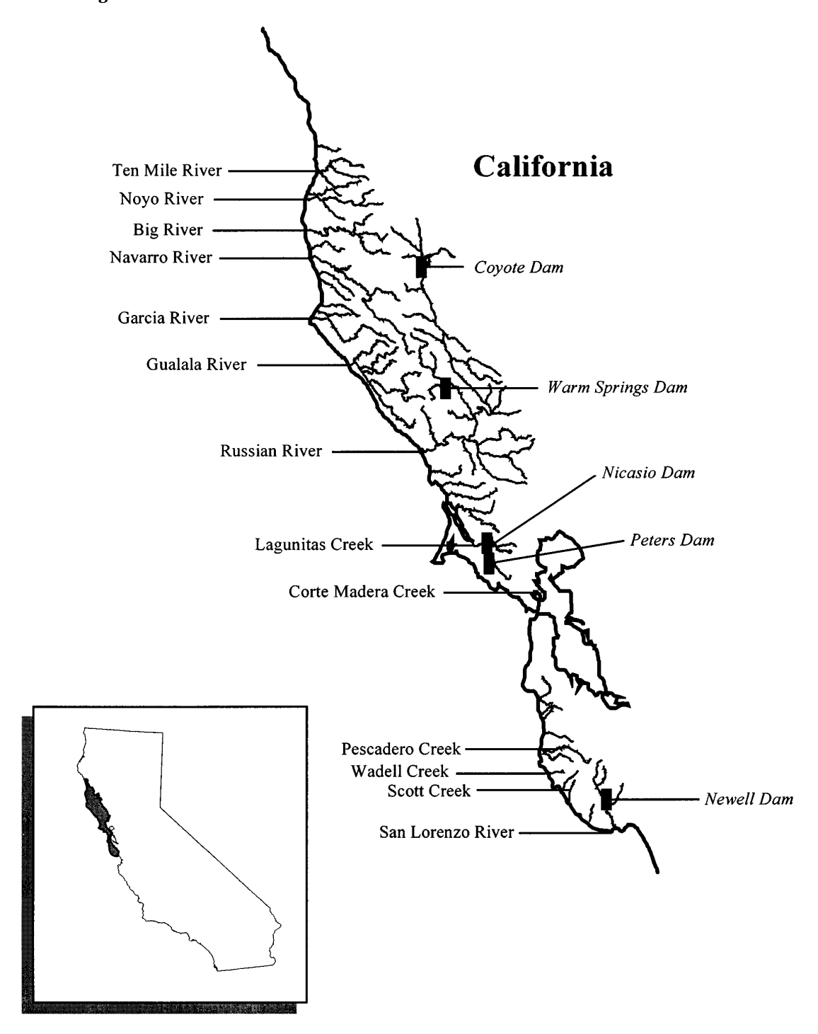
Figure 10 to Part 226.—Critical Habitat for Central California Coast Coho Salmon